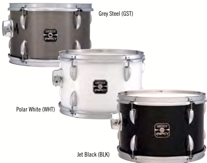
Grey Steel (GST)