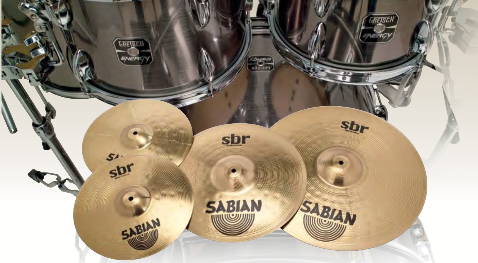
Sabian SBR Cymbal Pack