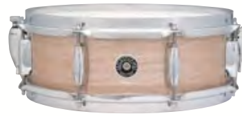
Vintage Cream Oyster