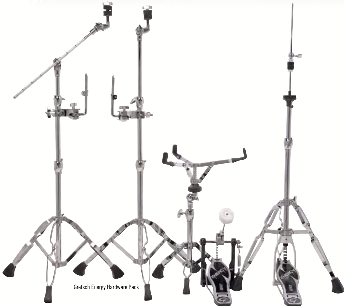
Gretsch Energy Hardware Pack