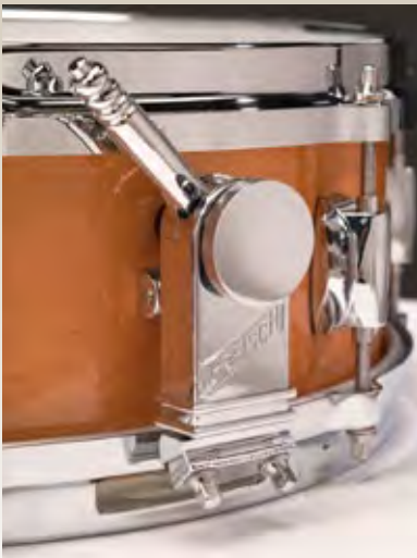
Pictured: Gretsch Microsensitive Snare Strainer