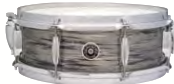
Smoke Grey Oyster