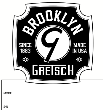
Interior Shell Label

Proudly hand crafted in Ridgeland, South Carolina, USA, by a team of veteran drum builders, Gretsch Brooklyn has a sound that is at once recognizable and essential, yet distinctively reinvented. The Gretsch drum design team molded the Brooklyn series by combining classic Gretsch elements while infusing it with new attributes. They expanded upon traditional drum designs to shape a sound that retains fundamental Gretsch characteristics while projecting a fresh voice.