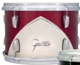
Motor City Red (MCR)