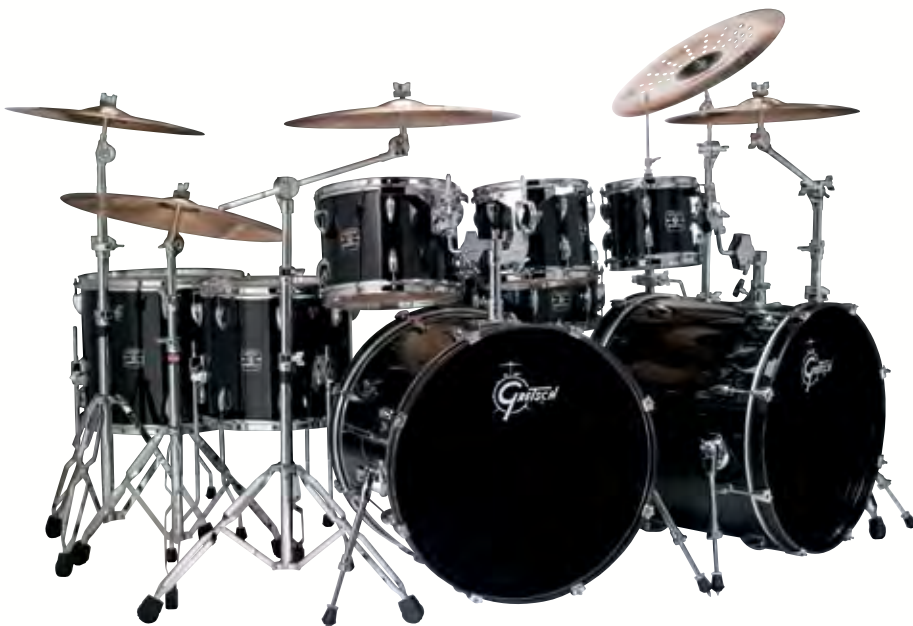
GE-E2828-BLK (Hardware and cymbals not included)