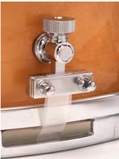
Gretsch Microsensitive adjustable butt plate