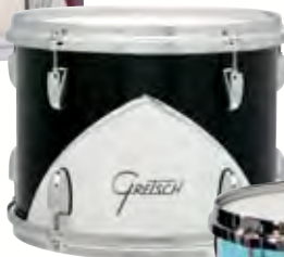
Motor City Black (MCO)