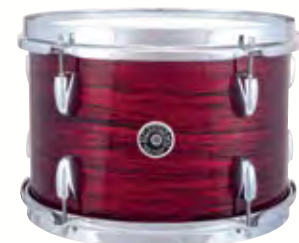
Ruby Red Oyster