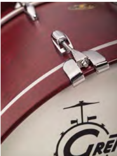
Pictured: Die Cast Padded Claw Hook