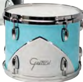
Motor City Blue (MCB)

The Renown 57 Bop kits are a logical extension from the wildly popular Renown 57 kits. Inspired by the great American car companies from the 1950's. The bop configuration is a compact set-up but packs a ferocious punch. The smaller drums are great for a jazz setting or where space is limited. They feature the Renown Chevron which is an aluminum triangular teardrop painted white with raised beveled chrome edges and embossed chrome Gretsch logo.